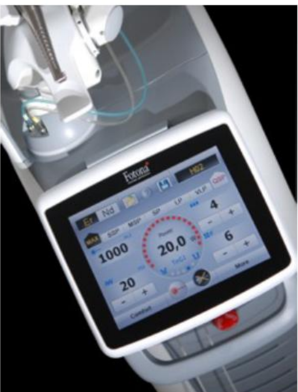
2016 ACT Laser Education